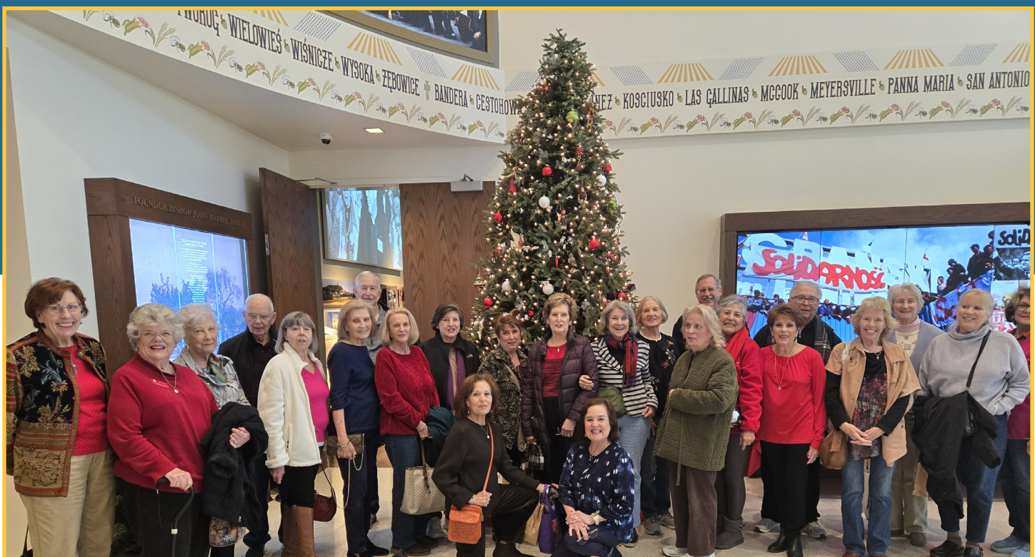
Jubilee Pilgrimage Group from St. Matthew's, San Antonio