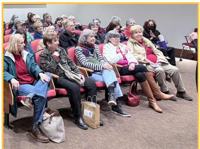
Jubilee Pilgrimage Group from St. Matthew's, San Antonio

We have set the bar higher this year! With the help of our donors, the Board, our docents and a wonderful staff, there is no doubt we will fulfill each of these goals.